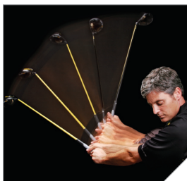
Resists slices, "coming over the top," and "casting" (early release)

What does that mean to you? For the first time, a training club teaches the "feel" of a correct swing—perfectly on-plane with a proper release—rather than just mechanics and positions. And that leads to grooving a smooth, natural swing for longer, straighter shots.