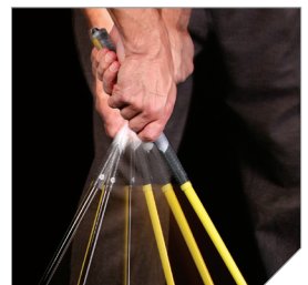
Dual-color shaft reveals off-plane swings (you see yellow instead of black)