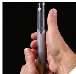
See-through training grip guides proper hand placement