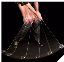
Forces the release at just the proper point for effortless power like the pros